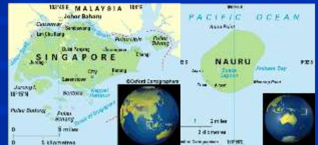
Singapore (Asia) Pop – 5.0 m (2010)